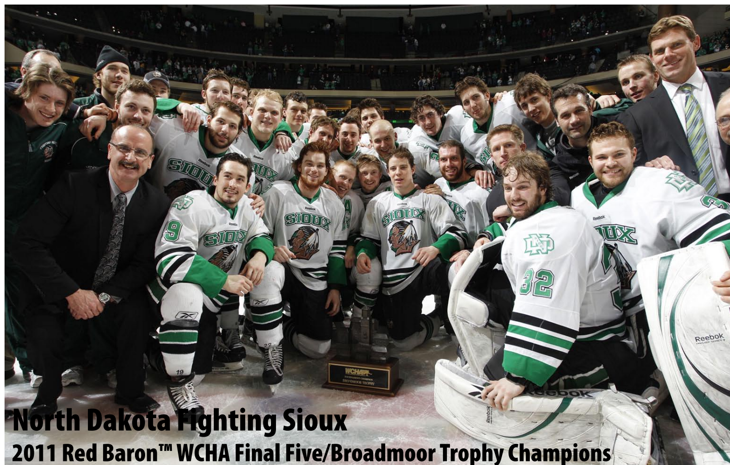
North Dakota Fighting Sioux 2011 Red Baron™ WCHA Final Five/Broadmoor Trophy Champions

WCHA West Regional @ Denver, CO. 1st Round: Denver 4 vs Minnesota Duluth 1; Colorado College 5 vs North Dakota 4. Championship Game: Denver 3 vs Colorado College 1.