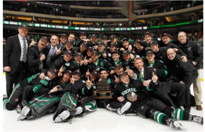
NORTH DAKOTA FIGHTING SIOUX 2010 WCHA FINAL FIVE & BROADMOOR TROPHY CHAMPIONS