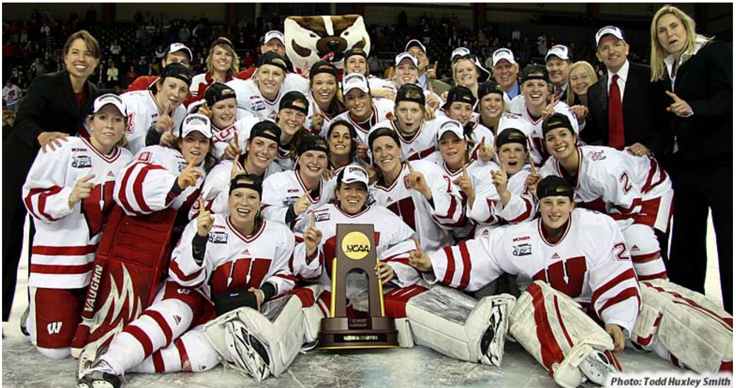
University of Wisconsin Badgers • 2011 NCAA Frozen Four Champions

The season long, 112-game conference slate, which consists of each league-member team playing a total of 28 WCHA games (four games vs each of other seven members – two home and two away), opens the weekend of Friday-Sunday, Oct. 7-9, with three two-game series. Defending WCHA regular season Wisconsin will host North Dakota, Minnesota will entertain St. Cloud State, and Ohio State will host Bemidji State. Minnesota Duluth and Minnesota State, meanwhile, won't open their respective league seasons until Oct. 21-22 when the Bulldogs entertain Wisconsin and the Mavericks play at Minnesota. The conference schedule concludes the weekend of Feb. 17-19.