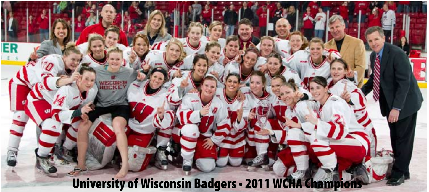
University of Wisconsin Badgers • 2011 WCHA Champions