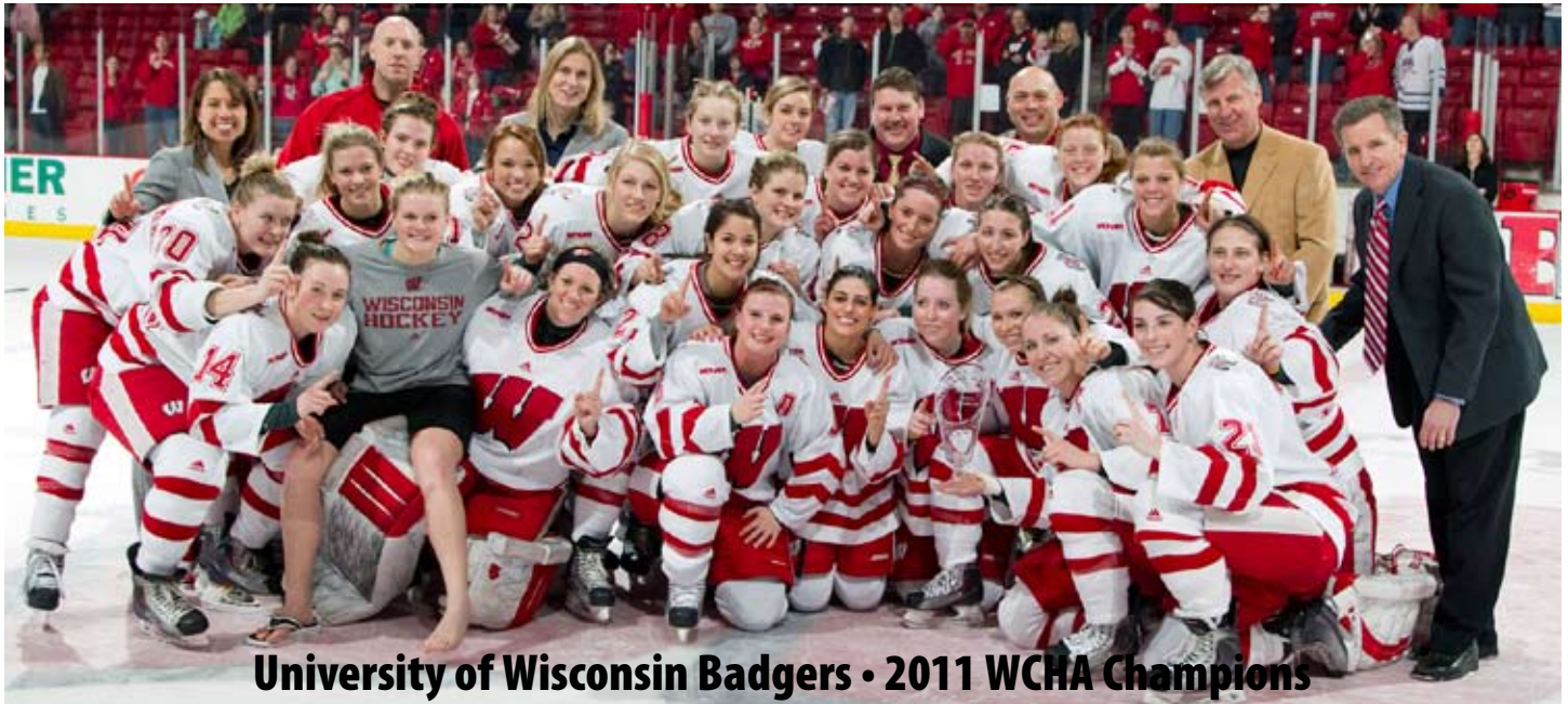
University of Wisconsin Badgers • 2011 WCHA Champions